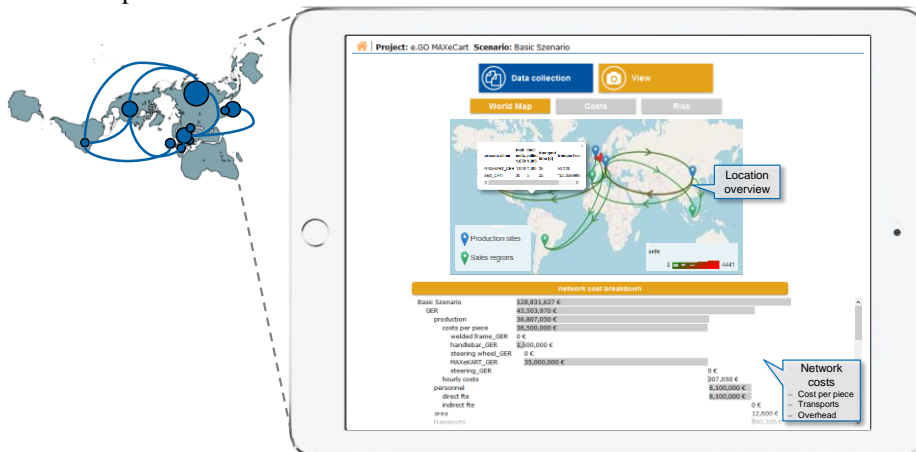
Fig. 3. Visualization of transport relations, delivery times and costs in a production network

After data collection, the tool summarizes the results of the network analyses in a “viewer” as shown in Fig. 3. The viewer offers several interactive visualizations where the user gets an overview of the existing production network as well as a deeper insight, if desired by several mouse over effects and access to additional information. In detail the named network target values costs, delivery times and network risks are visualized for each production site. Thus, the connection between these target values is visualized in a user-friendly way, which supports the user in understanding the impact of his decisions about product allocations and value added distribution.