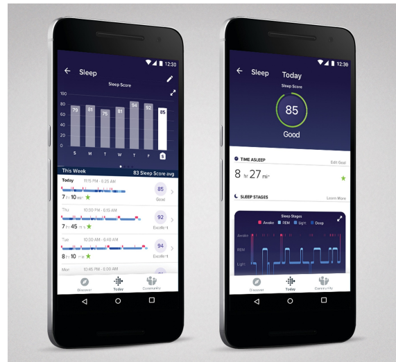
Figure 2. The Fitbit mobile app shows daily sleep scores with a standard bar chart (left) while displaying different sleep stages with a custom chart (right).

The difficulties of designing visualizations for mobile, however, are not only related to the interaction concept. Mobile devices these days often have very high-resolution displays but the limited physical size requires rethinking minimal sizes for the display of data points and reference structures (e.g., grids, labels, tickmarks). Scalability regarding smaller rather than larger display sizes becomes a problem for mobile visualizations and we need more perceptual studies to understand