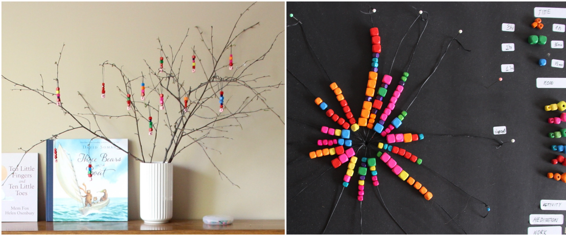
Figure 1. Examples of data physicalization with personal data [5]. (Left) A bead ornament daily to decorate branches with 4-hour interval represented by one bead with size showing her mood and colour showing whether she was active, social, or home. (Right) a participant's six different activities (e.g., meditation, work) with different coloured beads, each representing one hour, with their size showing enjoyment.

Following this workshop, however, only a limited number of researchers have continued to work at the intersection of visualization and personal informatics (e.g., data physicalization shown in Figure 1 [5], research methods in personal visualization [6]). We call for further efforts and contributions to empower the general public while addressing meaningful visualization challenges.