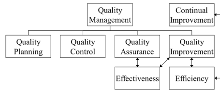
Fig. 1. A Quality Management Framework by ISO 9000:2015 [6]

In this paper, we propose a Quality Management Framework for Digital Lean Manufacturing based on the four ISO 9000:2015 pillars [6] of Quality Management: (i) Quality Planning, (ii) Quality Control, (iii) Quality Assurance, and (iv) Quality Improvement (see Fig. 1). Critical to this is the Lean principle of ‘respect for people’, which recognizes the unique contribution of human creativity, ingenuity and innovation (represented by the work of Quality Managers and their Quality Circles ) to quality planning, quality control, and quality assurance tasks, and in particular to quality improvement duties, given the onset of digital technologies in combination with the new practices of quality management.