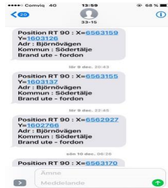
Figure 1. SMS-dispatched ICT solution for volunteers. The example displays outdoor fires in vehicles.