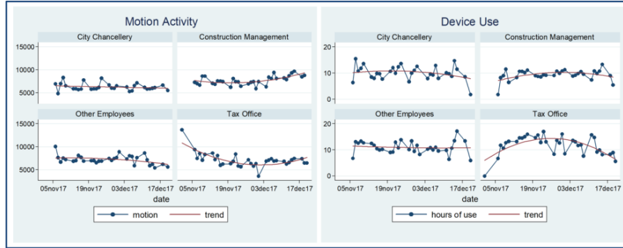
Fig. 4. Device use and motion activity during working days