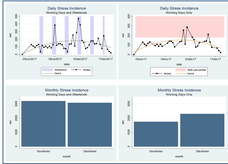
Fig. 2. Stress measurement on organizational with the Weighted Stress Incidence (WSI)

the device during leisure time). From the focus group discussion, we know that there has been a special occasion which required some administrators to work over weekends which could explain the higher stress levels). Overall November and December are equivalent in terms of WSI at organizational level.