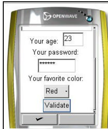
Figure 4 : Wap appearance

Figure 4 represents the WAP interface obtained for this device. The secret item, for example, has been translated in a password attribute in the input tag.