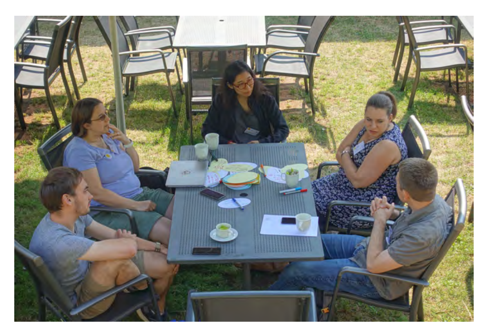
Figure 7 Group 8 discussing glanceable mobile visualization in the Dagstuhl garden.