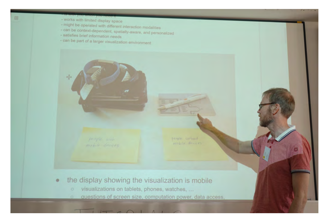
Figure 5 Report back from Group 2 on "What is Mobile Vis?"

Again, both the morning and afternoon were used for intensely discussing challenges, defining design spaces, shaping the knowledge on the given topic, and identifying opportunities for joint research. Groups also reported back to the plenum, and results were discussed openly. Section 4 provides more details on each of these working groups and their outcomes.