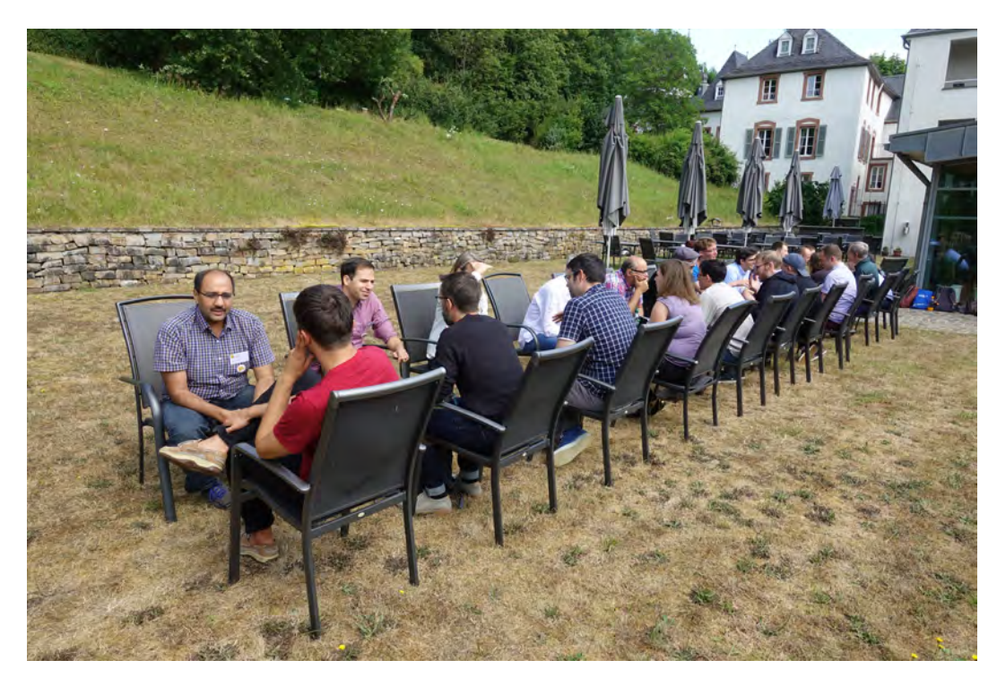
Figure 2 Exchange of research interest & background in a speed dating format.