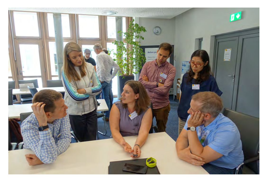
Figure 3 One of the mobile visualization demos presented to a small group of participants.

In a second activity, 14 participants presented a design critique of an existing mobile visualization, partly commercial products, partly research results (see Figure 4). Besides evoking the spirit of a good discussion, it helped getting a broad overview about currently available solutions.