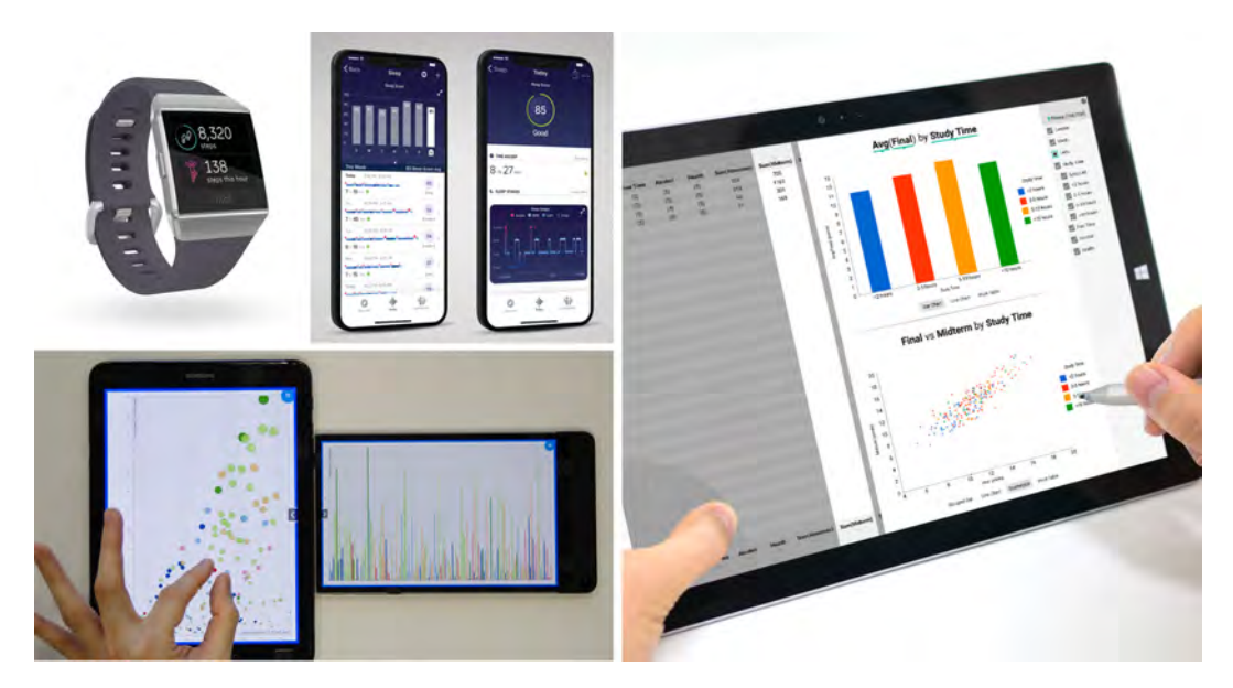
Figure 1 Examples of mobile data visualizations: step count and sleep data visualization on Fitbit Ionic and mobile app (top left); a multiple coordinated views across two mobile devices in VisTiles (bottom left); and visual data exploration on a tablet leveraging pen and touch interaction in TouchPivot (right).

research communities, such as Human-Computer Interaction (HCI), Information Visualization (InfoVis), and Ubiquitous Computing (UbiComp) have not paid enough attention to mobile data visualization.