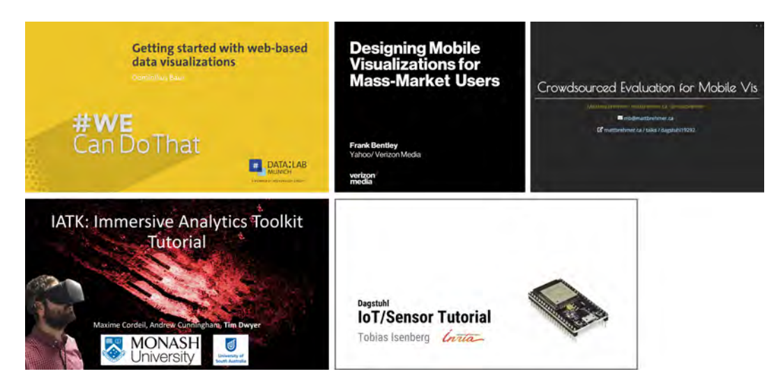
Figure 6 Title slides of all five tutorials presented at the seminar.