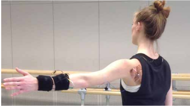
Figure 2. The circuits in tennis bracelets with the copper conductive sensor