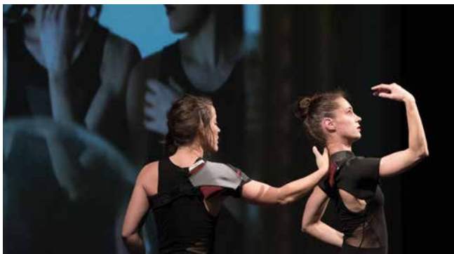
Figure 4. The dancers touching the mobile phone to freeze the sound and the video.

action? When we hid the mapping, the risk was unclarity and when we revealed it, the risk was obviousness. According to [53], our final design choices are revealing the manipulations (touch) and the effect (freezing the media), unlike in the second scene where both the manipulations and the effect are hidden (the audience does not see the dancers' heartbeat). We wanted the interaction to be visible yet not boring, clear yet not too predictable, expressive yet not too ambiguous. This balance surely affects the audience engagement with the piece, but that we could not know in advance.