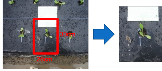
Fig. 2. Trimming to 30 cm \times 26 cm.

Image size change. The image size is changed to input CNN. The 30 cm \times 26 image size is changed to 75 pixels \times 65 pixels.