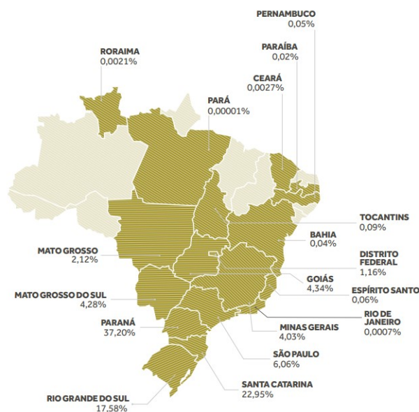
Fig. 1. Brazilian states producers of broiler meat and the corresponding percentage of production in 2017.

It was verified, in the field research carried out, that the farm has an installed capacity of 625 thousand broilers/year, and such production represents 62.7% of broiler production in the municipality of Altos [5]. It was observed that it presents a guarantee of full consumption by the domestic market, confirmed by [3]. The report indicates that the State of Piauí is ranked 18 th in the ranking of broiler production in Brazil, but it is not noted at the national level as an export market, as shown in Figure 1.