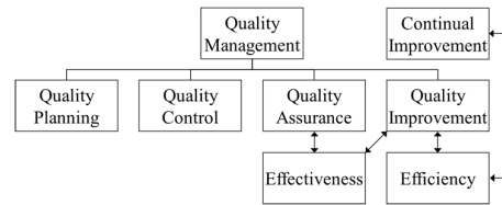
Fig. 1. A Quality Management Framework by ISO 9000:2015 [6]

In this paper, we propose a Quality Management Framework for Digital Lean Manufacturing based on the four ISO 9000:2015 pillars [6] of Quality Management: (i) Quality Planning, (ii) Quality Control, (iii) Quality Assurance, and (iv) Quality Improvement (see Fig. 1). Critical to this is the Lean principle of ‘ respect for people ’, which recognizes the unique contribution of human creativity, ingenuity and innovation (represented by the work of Quality Managers and their Quality Circles ) to quality planning, quality control, and quality assurance tasks, and in particular to quality improvement duties, given the onset of digital technologies in combination with the new practices of quality management.