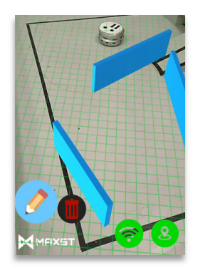
Fig. 4. Mobile Robot and Virtual Walls

Fig. 4 shows an example scene. The three blue fences are the virtual walls drawn by the user.