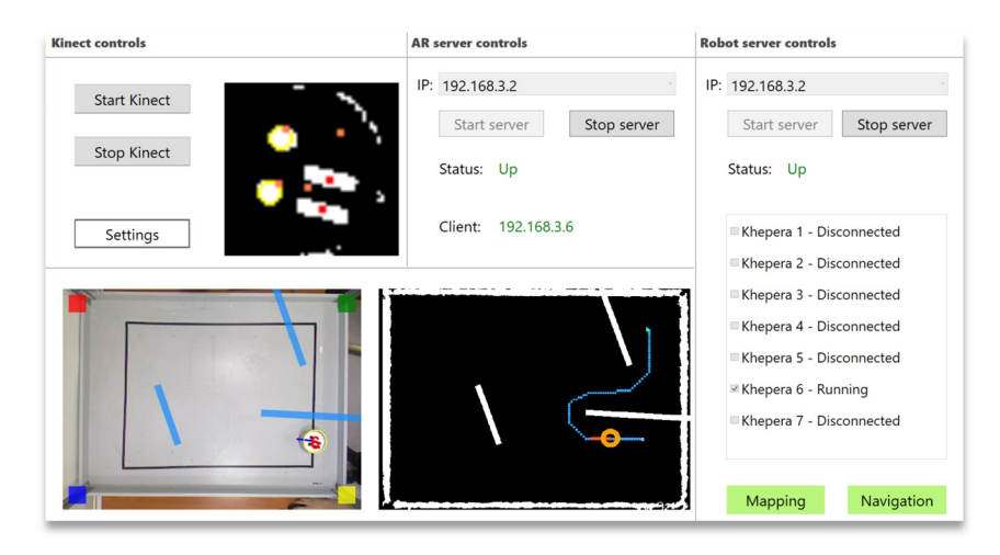
Fig. 3. The Core App Interface

Core app. All the AR system logic is implemented in the Core app running on a desktop computer. It uses custom protocol built on TCP/IP sockets for efficient twoway connection with both the AR app and the Robot app. The first step is receiving data from the AR app, and additional data from the Microsoft Kinect [13] sensor. These are then combined and processed using various computer vision methods, resulting in the final map of the "cyber-physical smart warehouse environment" containing both virtual and physical objects. Next step is the calculation of the path/route that the mobile robot should take between its current and final position for a product pickup and delivery. Dijkstra's shortest path algorithm [18] was implemented for path planning. This algorithm was chosen because it guarantees to find the shortest path, and is relatively simple to implement. Its drawback is that the algorithm is not the most time-efficient one, but given the size of our pilot smart warehouse space, it only takes a few milliseconds to calculate the AGV path/route. The layout of the Core app can be seen in Fig. 3 and consists of four main parts.