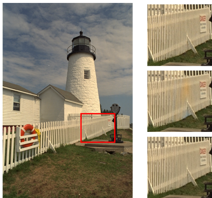
Figure 2: Demosaicking result obtained by our method. Top right: Ground truth. Middle: Image demosaicked with our sparse coding baseline without non-local prior. Bottom: demosaicking with sparse coding and non-local prior. The reconstruction does not exhibit any artefact on this image which is notoriously difficult for demosaicking.

Training dataset. In our experiments, we adopt the setting of [40], which is the most standard one used by recent deep learning methods, allowing a simple and fair comparison. In particular, we use as a training set a subset of the Berkeley Segmentation Dataset (BSD) [30], commonly called BSD400, even though we believe it to be suboptimal. BSD400 is indeed relatively small, with only 400 medium-resolution images, some of which suffering from a few compression artefacts. We evaluate the models on 4 popular benchmarks, called Set12, BSD68 (with no overlap with BSD400), Kodak24, and Urban100, see [43]. For demosaicking we evaluate our model on Kodak24 and BSD68.