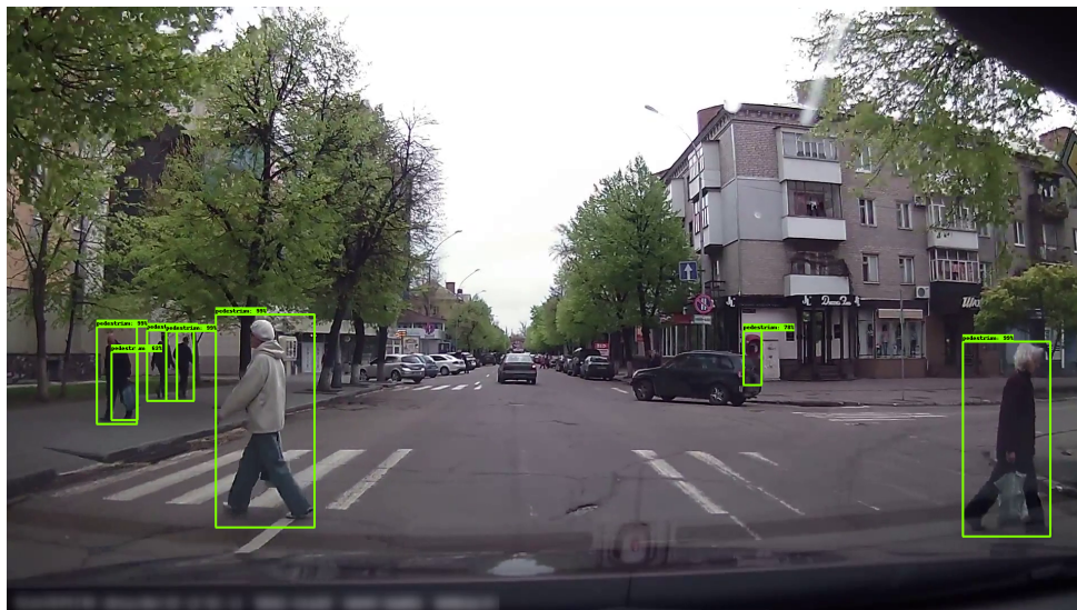
FIGURE 2. Pedestrian detection using the pedestrian tag for all pedestrians.