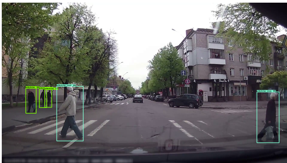
FIGURE 3. Pedestrian detection using multiple tags.

the model is evaluated on the holdout sample to give an unbiased estimate of model skill.