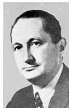
Fig. 1. Kazimierz Kuratowski.

On December 23, 1948, the weather in Warsaw was particularly bad. Wet snow continued to fall as the inhabitants of the ruined city desperately tried to salvage what they could of their holidays with a meager meal for their family. Only a small group of people seemed untroubled by the worries of the upcoming celebrations. These were attendees of a seminar on electronic calculating machines, listening to a talk given by Kazimierz Kuratowski.