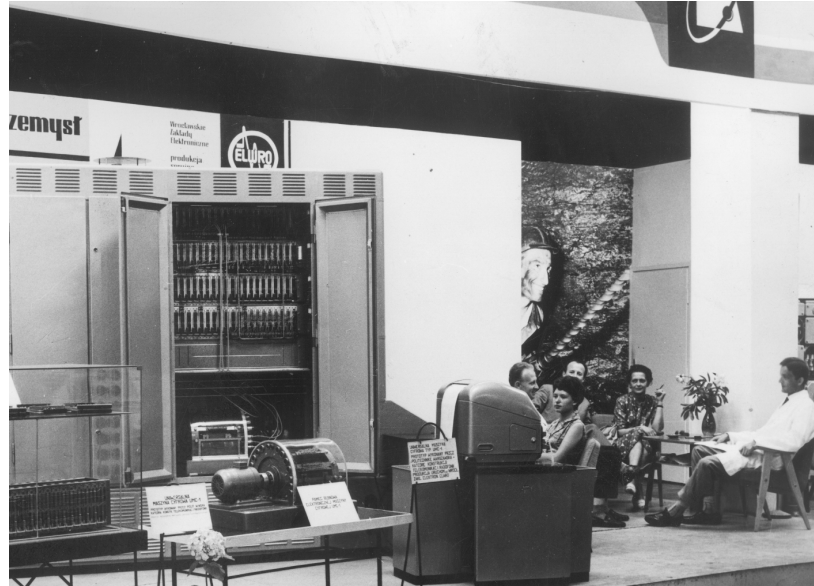
Fig. 9. UMC-1 at the exhibition in Moscow; drum memory was exposed in the foreground.

The most well-known of the computers created at the Warsaw University of Technology was undoubtedly the UMC series (Universal Digital Machine). The UMC-1 prototype was developed in 1960. It was a machine capable of performing 100 operations per second, equipped with a drum memory capacity of 144 kilobits. The construction was so successful that it was chosen for large-scale serial manufacturing. Its blueprints and documentation was handed to Elwro factory, where industrial production began the next year. By 1964, 25 of these machines were made. UMC-1 was a vacuum tube machine, but later versions, such as the UMC-10 (which replaced it in 1965) used transistors and magnetic-core memory.