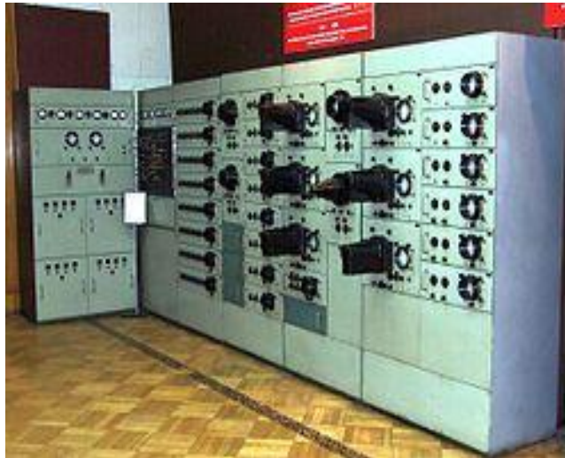
Fig. 2. Differential Equations Analyzer.

Finally, in 1953, they were able to get something working: an analog machine built with vacuum tubes, which was called the Differential Equations Analyzer (ARR). It was able to solve complex differential equations with very high accuracy and was used for a number of practical applications, including the design of turbines and aircrafts.