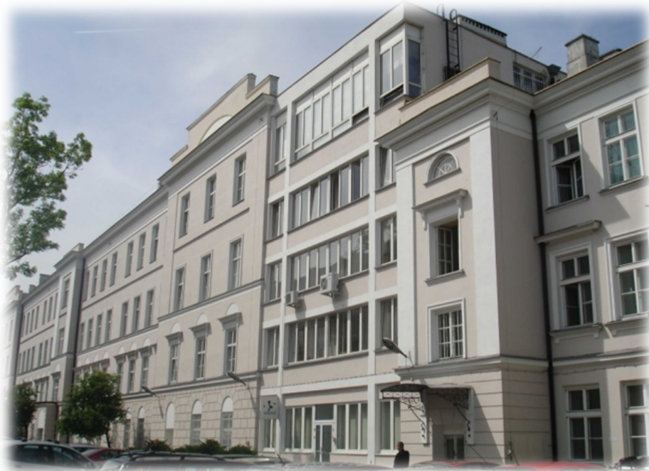
Fig. 7. Instytut Maszyn Matematycznych.

The word “computer” was only allowed to appear in the Polish language fairly late – in the mid-1970s. Before, it was routinely replaced by the censors’ office with the phrase “electronic calculating machine,” a compulsory copy of the Russian term for computers.