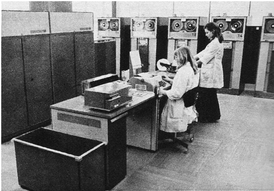
Fig. 12. ODRA 1304.

Despite the challenge, the team was ultimately successful. The first prototype of the Odra 1304, produced in early 1970, behaved exactly the same way as the ICL 1904, supporting all the same features: the George operating system (then regarded as one of the best in the world), several programming languages (including Algol, Fortran and Cobol, the most widespread at the time) and a library of over a thousand ready-to-use programs. An extensive set of external devices also functioned as expected.