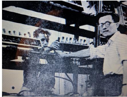
Fig. 3. Romuald Marczyński (in a white shirt) while working on the Electronic Machine for Automatic Calculations (EMAL) [2].

The first attempt to construct a digital machine was made in the years 1953–1955 by the team led by Romuald Marczyński. The Electronic Machine for Automatic Calculations (EMAL) was said to perform 2000 additions or subtractions, 450 multiplications, and 230 divisions per second. The solution which allowed for the “fast” memory of this machine consisted of a number of glass tubes filled with mercury, which could often not be sealed adequately, resulting in a health hazard.