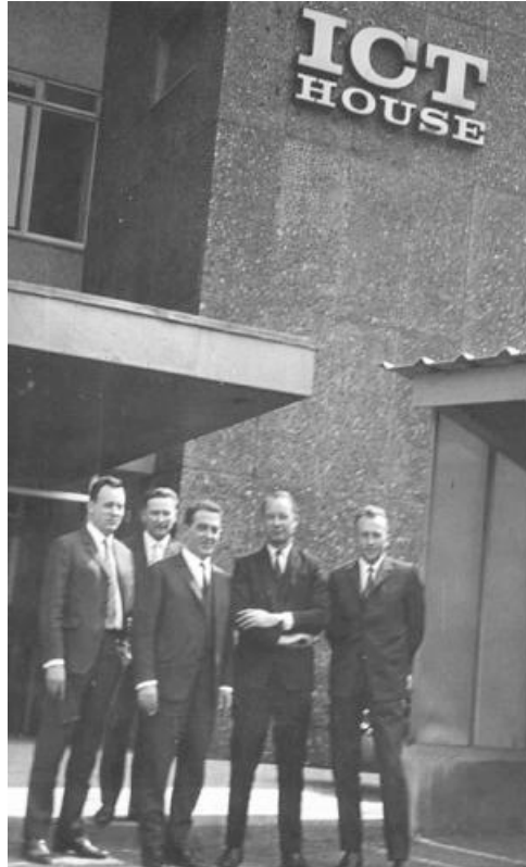
Fig. 11. Polish delegation in front of the ICT headquarters [13].

In order to create necessary software, Elwro would have to organize a large group of expert programmers and provide them with the necessary time. Instead, the plan was made to use the software of one of the reputable foreign companies and avoid this problem. That is, instead of creating software for an existing machine, build a computer on which existing software would work properly.