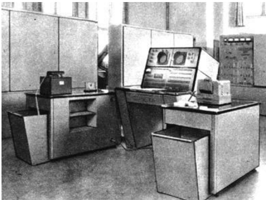
Fig. 6. ZAM-2.

At that time, commercial applications for such an efficient machine had only just begun to emerge. In 1960 the first improved version of XYZ, called ZAM-2, was built. It included 600 kilobits of memory, teletype and a paper tape reader, and was suitable for mass production. The software, especially System of Automatic Coding SAKO (often dubbed a Polish Fortran), was one of the major selling points of this machine. For the next three years a series of twelve units were produced, a number which was quite significant for the time.