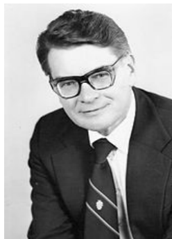
Fig. 5. Leon Łukaszewicz

The head of the team, prof. Leon Łukaszewicz, when asked by journalists why the machine was named XYZ, would answer: "Well, the version we started with was called ABC, and then there were others." Łukaszewicz was also the representative of the Polish Academy of Sciences to IFIP from 1961 to 1985 and Vice President of IFIP from 1964 to 1968.