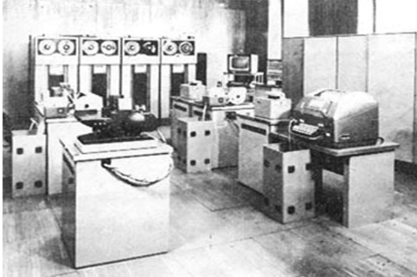
Fig. 13. ZAM-41.

The IMM teams traveled back and forth to their counterpart institute in Yerevan, returning with cheaply bought Ararat cognac for their friends. In Warsaw, however, their task was met without much enthusiasm something which had been forced on them. This lack of enthusiasm ultimately led to the initiative being taken over from the IMM by the more dynamic Elwro.