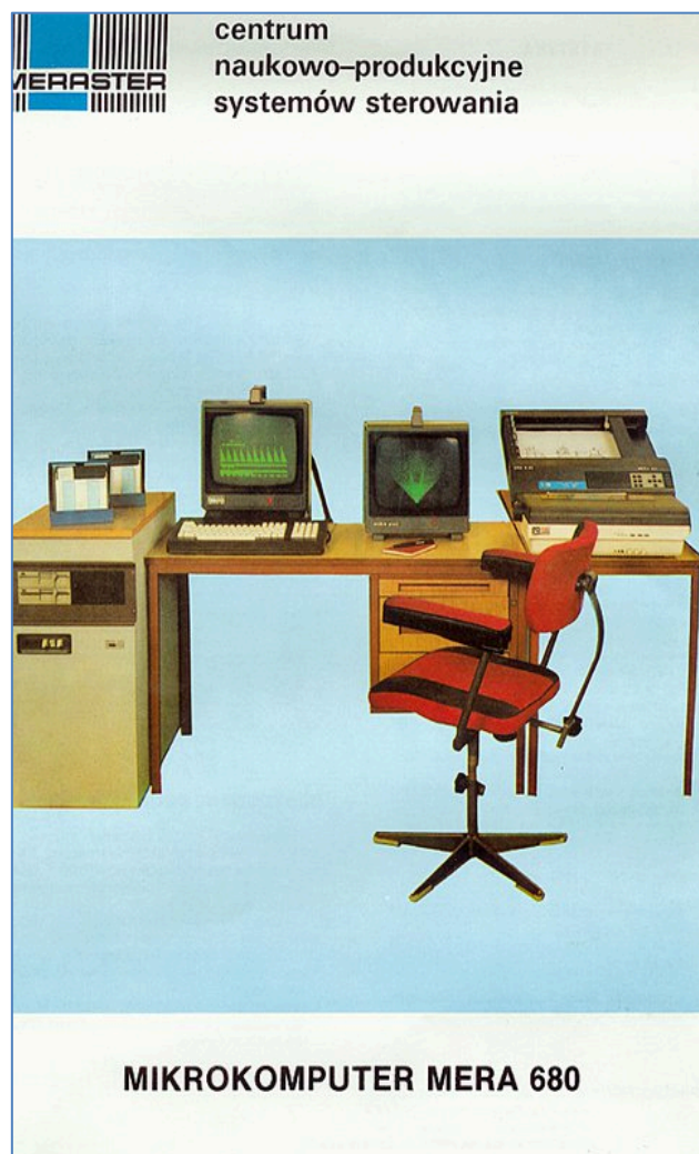
Fig. 1. In the 1980s, the Polish computer industry was able to export remarkable quantities of minicomputers to Comecon and especially to the Soviet markets, as in case of MERA mini-computers of series 60 manufactured in Silesia.

germanium dioxide imported from western countries. TEWA itself was producing monocrystalline germanium. On the other hand, work was underway on launching production of high resistance polycrystalline silicon at the nitrogen plant in Tarnów. The targeted production capacity of Tarnów was to reach 5.9 tons per year in 1967. This was even higher than the forecasted demand for this intermediate product until 1970.