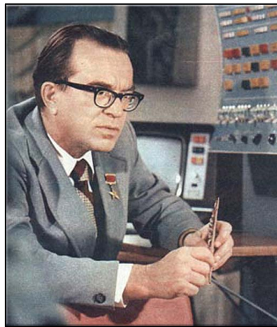
Fig. 6. V.M. Glushkov – pioneer of informatics and information society (1979).

Glushkov’s academic position was active. His more than 250 publications in popular scientific and public journals and newspapers, as well as the regular cycles of lectures for the top management of the country and the public, testify to this.