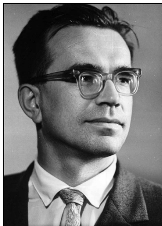
Fig. 3. Computer pioneer Victor Mikhailovich Glushkov (1964).