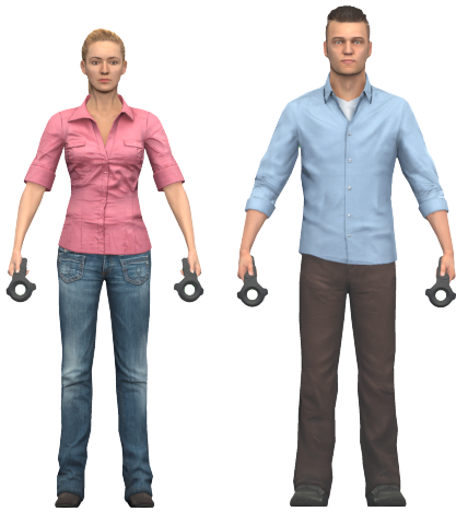
Figure 3: The two avatar models used in our experiments, which were matched to the gender of the participant.

occasion passive haptic feedback from the physical table. They hold in their hands the real controllers that were also represented in the virtual world for coherence concern. A virtual screen was positioned in front of them, on the table, and a virtual mirror was located on their left (Figure 1). We chose to use a mirror as it is supposed to induce a greater sense of ownership [19, 25]. Also, we decided to induce the sense of ownership using visuomotor feedback since it has been shown to be stronger than visuotactile synchronisation to induce body ownership [33].