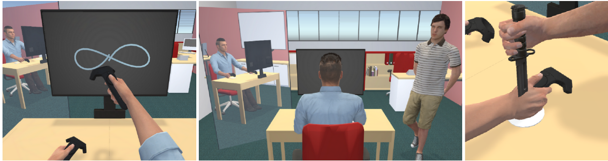
Figure 1: From left to right: an example of a trajectory to draw during the experimental task; A view of the scene from behind; Another virtual character stabbing the participants’ virtual hand at the end of the experiment to measure their response to the threat on their virtual body.

3 University of Barcelona, Event Lab, Department of Clinical Psychology and Psychobiology, Spain