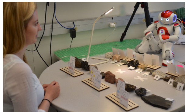
Figure 1: Setup of the game LinkIt!, designed to study human and robot behaviour, and played by participants in the study.

Curiosity in Social Robots: Design, Perception, and Effects on Behaviour. In CHI Conference on Human Factors in Computing Systems Proceedings (CHI 2019), May 4–9, 2019, Glasgow, Scotland, UK . ACM, New York, NY, USA, 12 pages. https://doi.org/10.1145/3290605.3300636