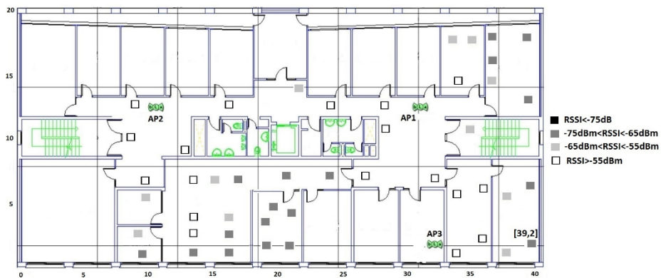
Fig. 5. RSSI measurements obtained after the AP Relocation i.e. AP3 at [32,2] .