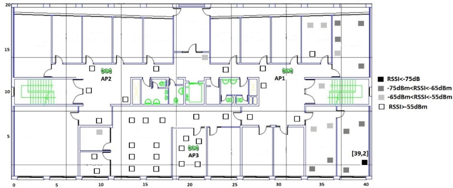
Fig. 4. RSSI measurements obtained before the AP Relocation i.e. AP3 at [20,4] .

sample u_{12} (e.g. to coordinates [37,2] ) is not a feasible solution since it causes some coverage problems at region around [17,8] . Similarly, relocating AP3 to coordinates [28,2] (i.e. not so close to u_{12} ) guarantees the coverage RSSI requirements at all the locations of the building but, an average RSSI=-73dBm is measured at u_{12} , which is not as good as the average RSSI=-67dBm obtained when implementing the best solution proposed by the genetic AP relocation algorithm.