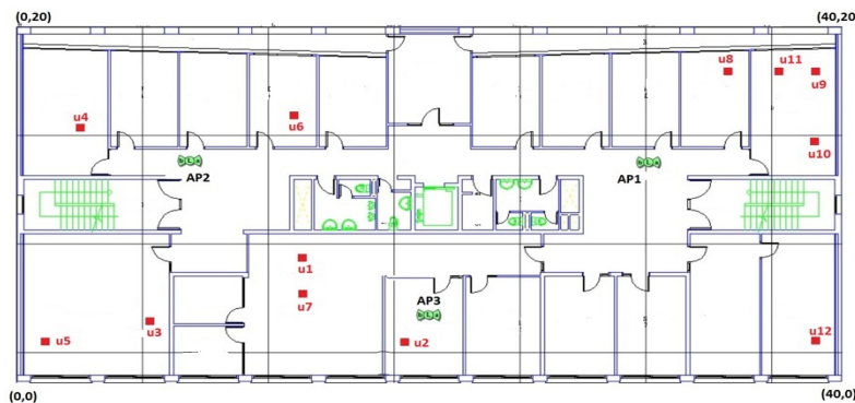
Fig. 2. Considered scenario with the set of U=12 samples.