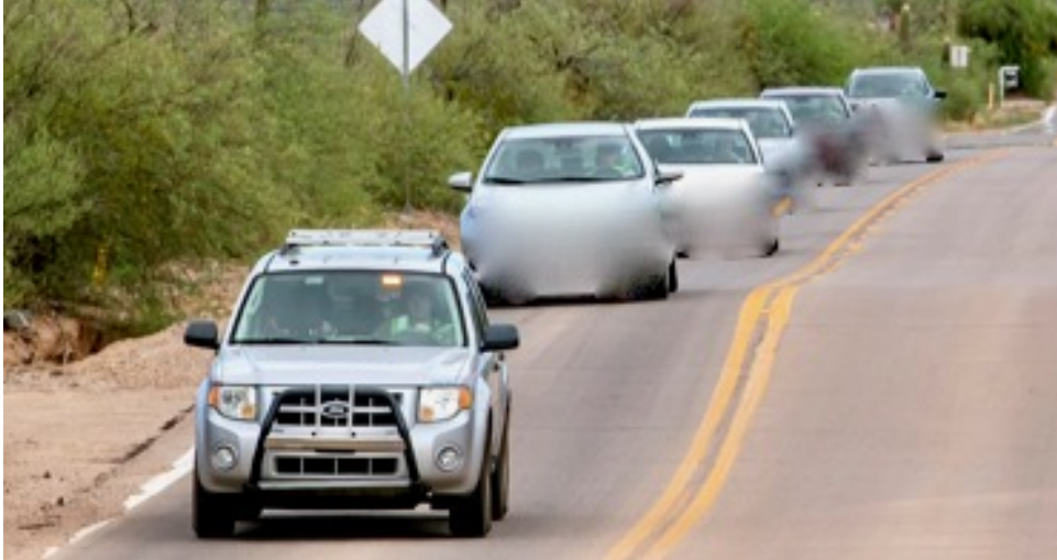
Figure 2: Platoon of vehicles in experiment with lead vehicle followed by four test vehicles and a safety chase vehicle. Test vehicle fronts blurred to remove branding.

Here f_s = \partial f / \partial s \geq 0 is the partial derivative of f with respect to space gap, f_{\Delta v} = \partial f / \partial \Delta v \geq 0 is the partial derivative of f with respect to the relative speed, and f_v = \partial f / \partial v \leq 0 is the partial derivative of f with respect to the speed.