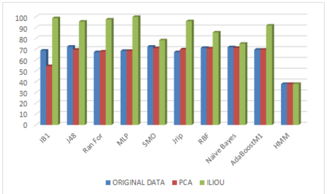
Figure 2. Experimental Results