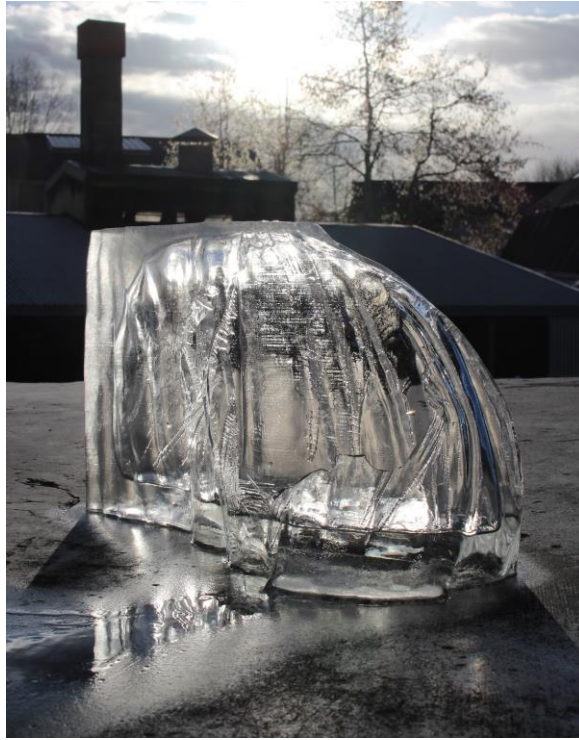
Figure 2. Grewingk Glacier. Adrien Segal, 2015.

Figure 2 shows changes in the natural landscape, occurring over a timespan imperceptible to humans, encoded in a sculpture. The sculpture represents the terminus shape of Grewingk Glacier in Alaska, and its recession over 150 years at an average of 92 feet (~28m) per year. Beginning with the 1850's, the data source was compiled from historical observation, aerial photographs, and satellite imagery that documented its shifting perimeter position over time.