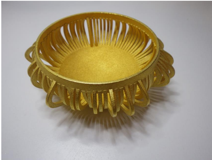
Figure 3. Chemo Singing Bowl. Stephen Barrass, 2014.

Data physicalization in the form of a sound-emitting object is called Acoustic Sonification (Barrass 2014). The physical form of the Chemo Singing Bowl (Figure 3), an artifact 3D printed in stainless steel, was created as a gift of thanks to a patient's mother for her care during chemotherapy. The variation in the splines around the bowl is shaped by blood pressure readings recorded over a year of chemotherapy treatment. When the bowl is struck or stroked with a mallet, its sound reflects the data used to shape it. However, the irregularity of the dataset caused the bowl to not sing harmonically. Upon hearing this, the patient responded "that's exactly how I felt at the time".