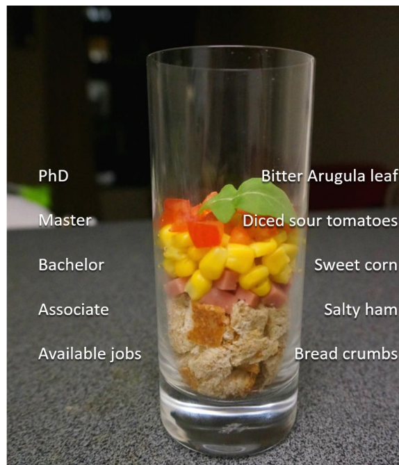
Figure 4. A salad cup to encode the number of annual STEM degree earners and STEM job openings. Yun Wang et al., 2016.

Data edibilization (Wang et al. 2016) leverages edible materials sensed by multiple perceptual channels to convey data stories. When compared with printed visualizations of the same datasets, edibilizations were found attractive, affective, sensorially and intangibly rich, memorable, and sociable. Figure 4 shows an edibilization in the form of salad, encoding annual STEM degree earners. The ingredients are stacked, with bread crumbs corresponding to available jobs, salty ham representing associate degree holders, sweet corns denoting bachelors, diced sour tomatoes referring to masters, and bitter arugula symbolizing PhD graduates. This example engaged viewers, aroused emotions, and deepened their understanding. One participant expressed, “I was puzzled about how the ingredients were chosen for the different (STEM) degrees. When I took a bite of the (arugula) leaf – the representation of Ph.D. – and tasted the bitterness, I said to myself, this is why.” Another mentioned: “eating my (edibilized) academic record means that I have accepted, understood, and digested the results. I have turned the past into nutrition for the future, and now I can let it go.”