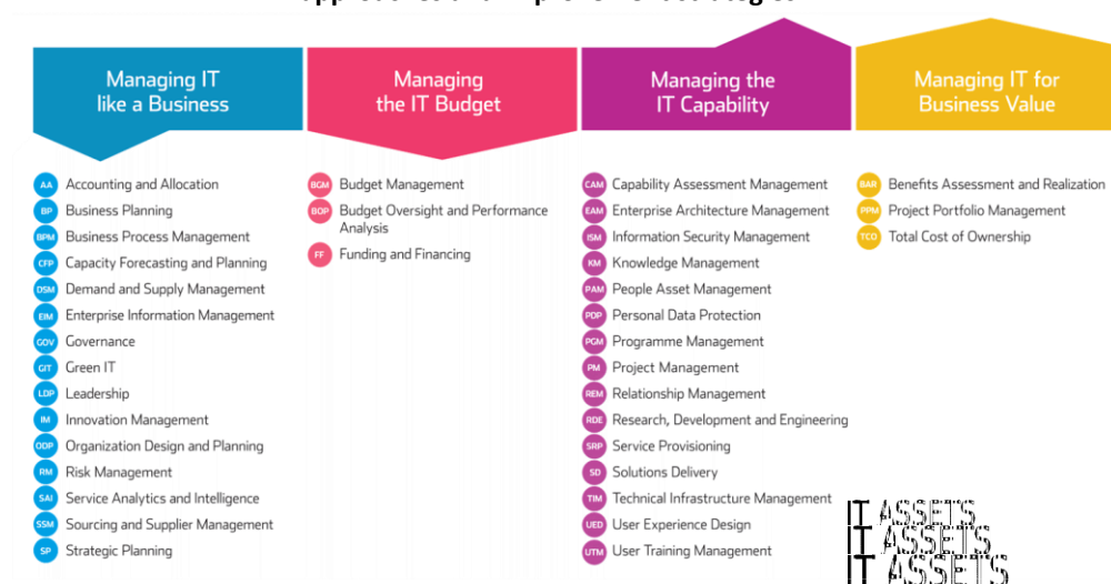
Fig. 1. The 36 Critical Capabilities – Adapted from https://ivi.ie/it-capability-maturity-framework

Four macro domains of the IT Capability Maturity Framework™ (IT-CMF™), which is a comprehensive suite of proven management practices, assessment approaches and improvement strategies