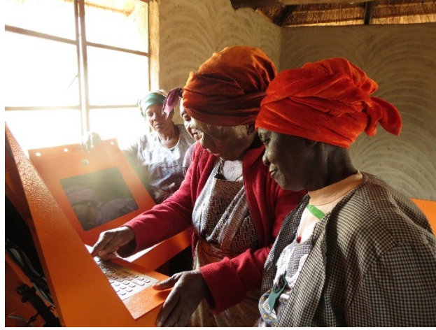
Fig. 1. Women using the ICT artefact in Mafarafara