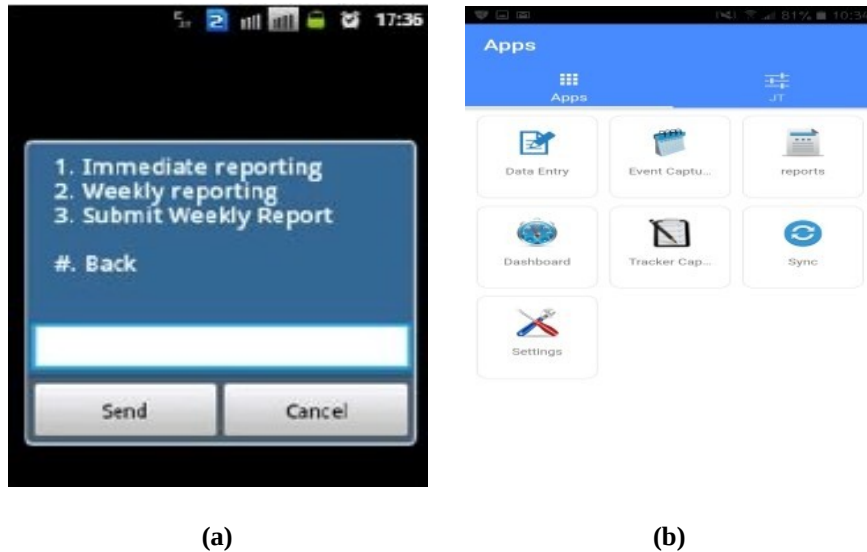
Fig. 1. Mobile interfaces of mobile health applications. (a) eIDSR (b) DHIS2 Touch