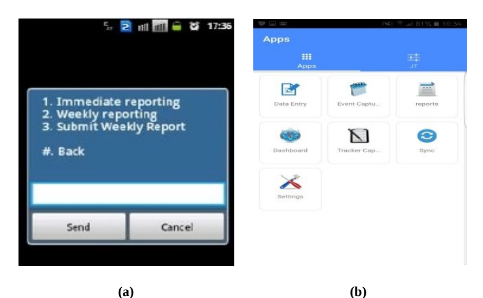
Fig. 1. Mobile interfaces of mobile health applications. (a) eIDSR (b) DHIS2 Touch