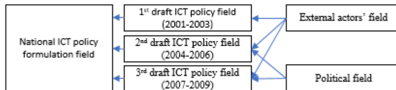
Figure 1: Overview of overlapping and nested fields of ICT policy formulation in Malawi

field, in which most of the external influences were located (see Figure 1). While the political field was nested within the second and third draft policy fields; the other field was nested within all the three fields.