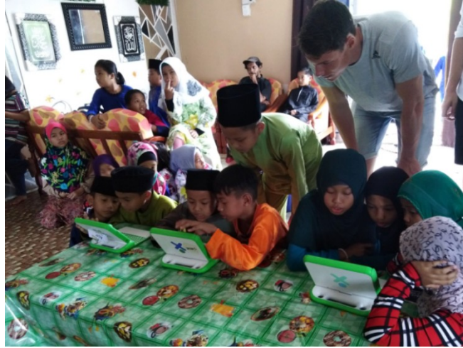
Fig. 1. Testing the EDUCOMX app with children in the kampung. EDUCOMX is platform independent. Here it is deployed on XO laptop from OLPC.

ban (private) schools. Since school subjects such as science and math are taught in English, poor knowledge of English limits education of rural children.