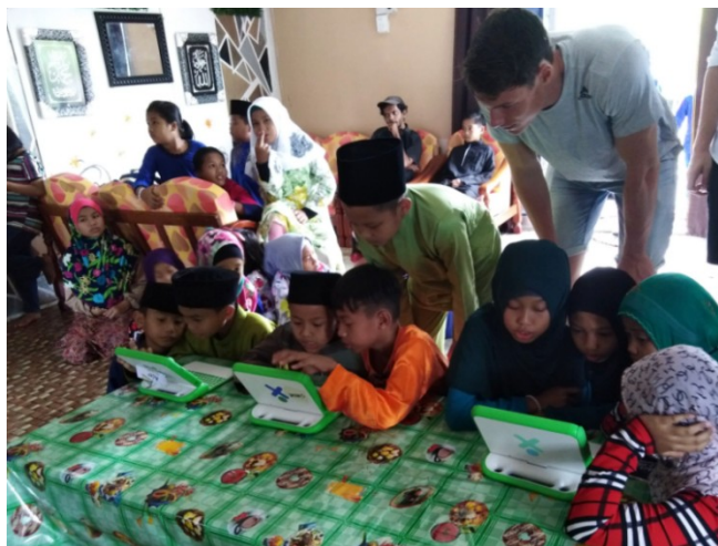
Fig. 1. Testing the EDUCOMX app with children in the kampung. EDUCOMX is platform independent. Here it is deployed on XO laptop from OLPC.

ban (private) schools. Since school subjects such as science and math are taught in English, poor knowledge of English limits education of rural children.