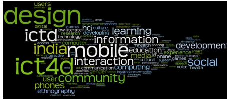
Figure 2. Global papers

We compared the keyword frequency for the global set (114 papers) with the A_SE set (56 papers) and depicted the results in Figures 2 and 3, respectively. That excludes the review papers, which are not country based, and inter-country studies. The terms design , mobile , ict4d , ictd and community dominate both sets. This highlights the importance of community and design-focused research, with mobile phones as the central technology, in HCI4D research (as supported by our survey). The terms participatory , rural and health feature more prominently in Figure 3. The findings reveal a diverse range of philosophies and methodologies; both the A_SE set and global papers have an action-orientated, design and development focus with due recognition of the user communities. This places HCI4D researchers in a strong position to respond to the calls for practice-led research [67].