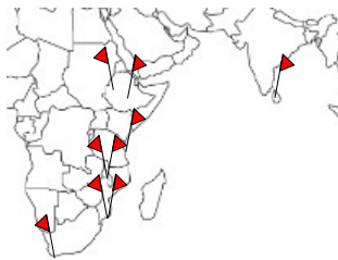
Fig. 1. Master programmes

The Health Informatics Master's Program was prompted by the Call for Master programmes by the Norwegian Centre for International Cooperation in Education [3] in the year 2000. Demands for information across the health sector within countries influenced the choice of area to become health information systems. The Norwegian Centre for International Cooperation in Education funded the establishment of the