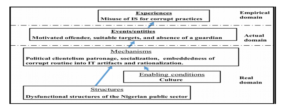
Fig. 1. A realist model of IS misuse for corrupt practices in the Nigerian public sector.