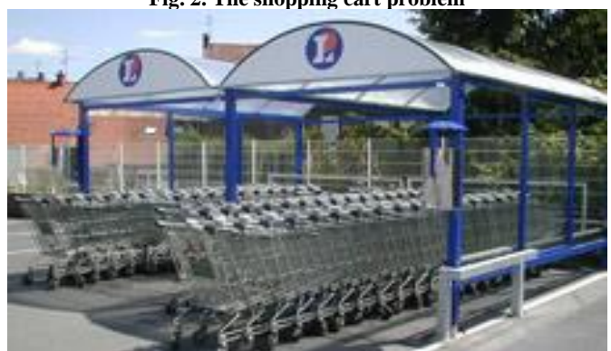
Fig. 2. The shopping cart problem

In this way, the application of the proposed approach facilitate problem solving by simply adapt the solution of the similar case that is retrieved.