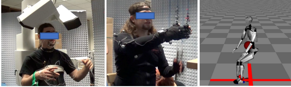
Figure 1: Speaker (MO1) recorded with two different mocap systems: the electromagnetic articulograph (EMA, on the left) and the IMU suit (in the middle) with the visualization of the latter in Axis Neuron (on the right).