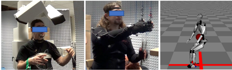
Figure 1: Speaker (MO1) recorded with two different mocap systems: the electromagnetic articulograph (EMA, on the left) and the IMU suit (in the middle) with the visualization of the latter in Axis Neuron (on the right).