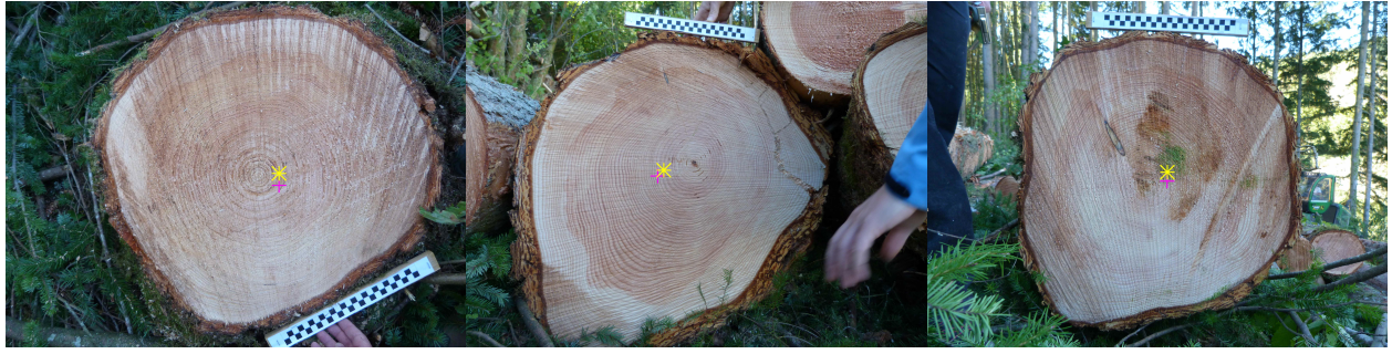
Figure 4 — Some cases where our method fails to detect precisely (less than 5mm) the pith. In red cross results of the first step, and in yellow star the results after the second step. The first two cases show the same log end but with a slight rotation. The error can be explained by a high presence of sawing marks, knot near the pith and green dirt near the pith. The third failure can also be explained by a high presence of sawing marks.