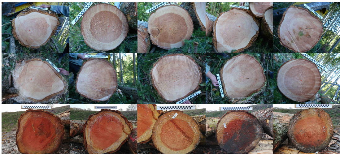
Figure 1 — Example of images of both image sets. The first two rows of images show some images from Besle dataset and the last row shows images from BBF dataset.

As we are interested in ambient light variations, dirt or sawing marks, we captured images as raw as possible. Each log has been taken several times (from 3 to 5 times) by slightly rotating or moving the camera between each view. In average, a pixel stands for 0.194mm. In our study, we considered that pith position is a unique pixel even if from a biological point of view it may occupy a larger area. Ground truths, i.e. the pith center position, have been manually assessed by two different operators.