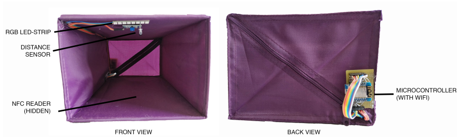
Fig. 2. Front and back view of the augmented shoe box.

without registering additional information or keeping an order. The NFC reader is hidden on the bottom part of the box, so there is no risk of breaking it when putting the shoes inside.