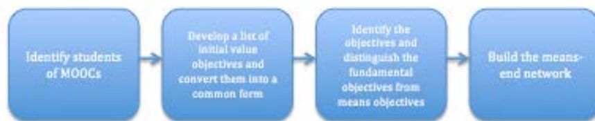
Figure 1. Steps of VFT Approach