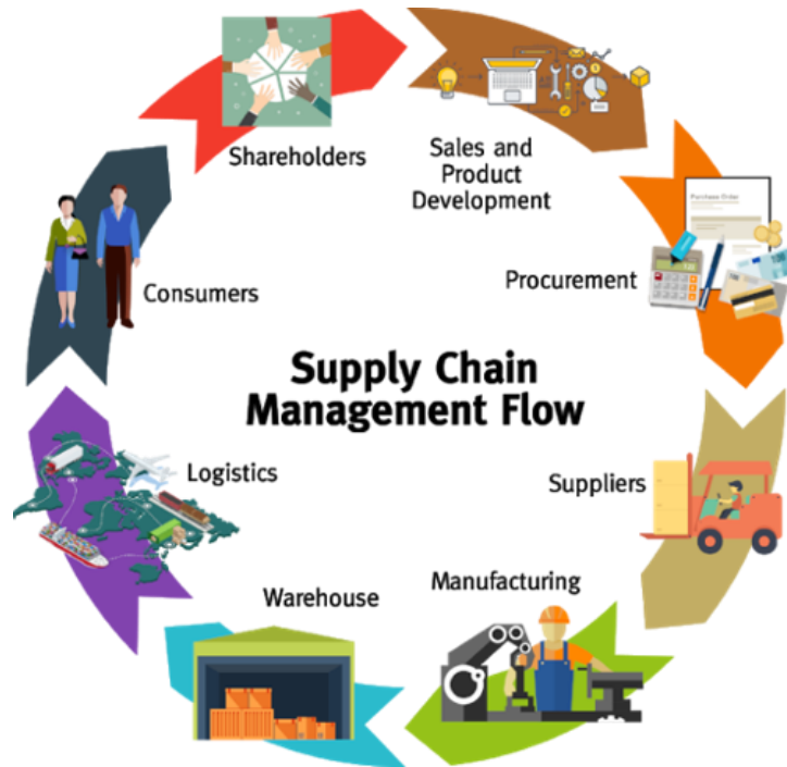
Fig. 1. Supply Chain Management Flow [2].

cance due to its contribution to reaching the ultimate goal of the business in terms of gaining revenue, customer satisfaction, loyalty and building brand and good reputation [1].