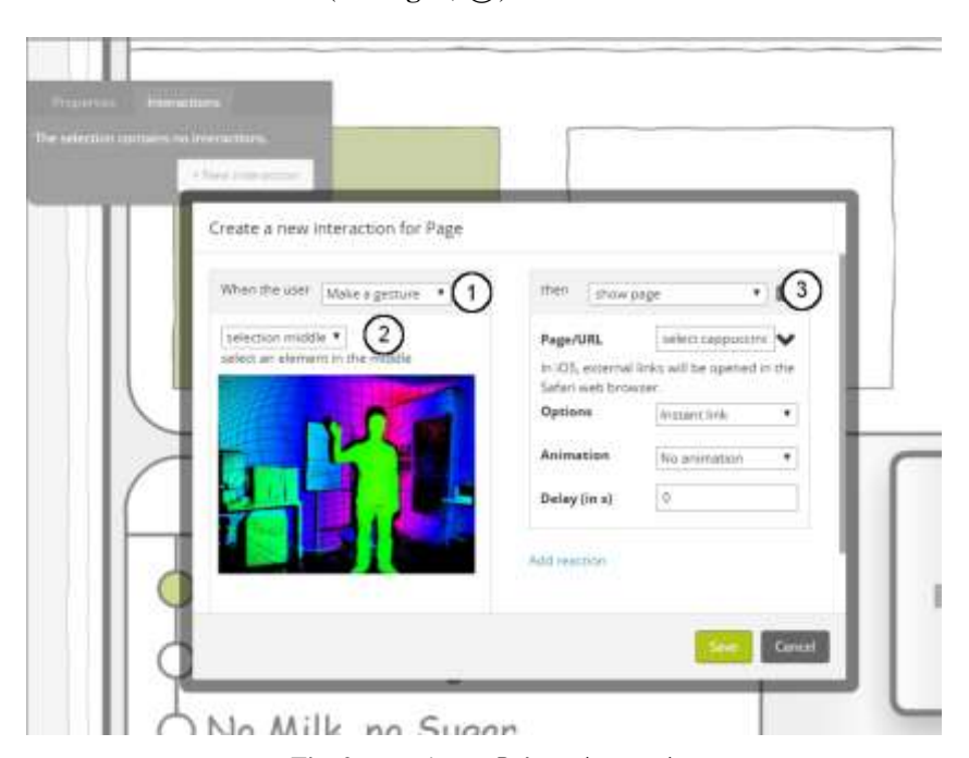
Fig. 2. Mapping in Pidoco (extract)

To specify gestures as actions within a prototype a gesture set (a set of sync triggers) must be loaded via file import into Pidoco first (another functionality that was also added to the Pidoco software). The gestures are then available as actions in the aforementioned context menu. After selecting an action (see Fig. 2 , (2)) it can be bound to the desired reaction (see Fig. 2 , (3)).