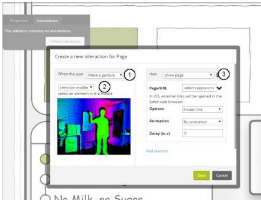
Fig. 2. Mapping in Pidoco (extract)

To specify gestures as actions within a prototype a gesture set (a set of sync triggers) must be loaded via file import into Pidoco first (another functionality that was also added to the Pidoco software). The gestures are then available as actions in the aforementioned context menu. After selecting an action (see Fig. 2 , ②) it can be bound to the desired reaction (see Fig. 2 , ③).