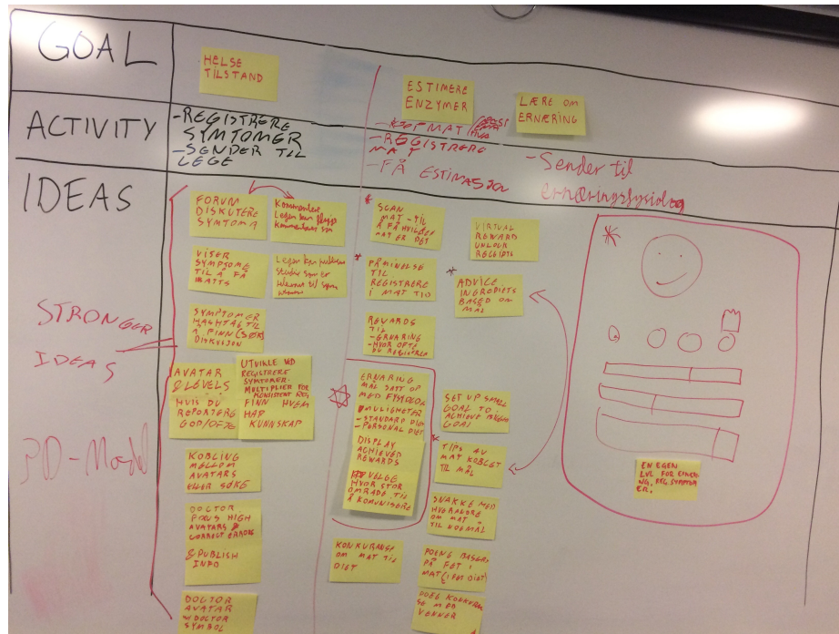
Fig. 3. Ideas resulting from brainstorming session

”gamification fit” scope. Designers in the project therefore decided to investigate whether gamification elements can be added to further motivate the users.