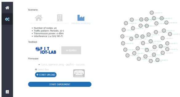
Fig. 3. Screenshot of the OpenBenchmark GUI section for scenario and testbed selection and firmware upload.