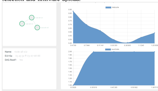
Fig. 4. Screenshot of the real-time KPI monitoring as the experiment progresses. The figure on the bottom depicts the increase in assigned bandwidth once the node has joined the network. The figure on the top shows how duty cycle varies depending on the phase.

and the rest of the OpenBenchmark components that are implemented in Python. The backend provides a RESTful API that enables the use of OpenBenchmark by 3 rd party applications.