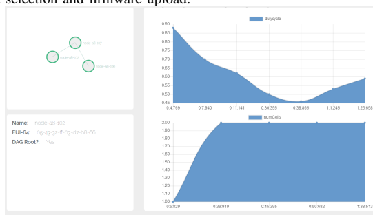
Fig. 4. Screenshot of the real-time KPI monitoring as the experiment progresses. The figure on the bottom depicts the increase in assigned bandwidth once the node has joined the network. The figure on the top shows how duty cycle varies depending on the phase.

and the rest of the OpenBenchmark components that are implemented in Python. The backend provides a RESTful API that enables the use of OpenBenchmark by 3 rd party applications.