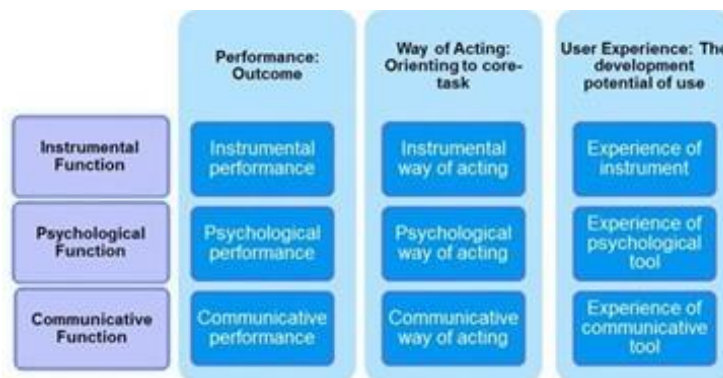
Fig.2. Systems Usability Framework [32].

Usability refers to “the extent to which a product can be used by specified users to achieve specified goals with effectiveness, efficiency, and satisfaction in a specified context of use” [19]. The satisfaction with a new tool forms a precondition for its positive impact on work satisfaction.