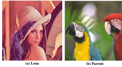
Fig. 1. Two test color images