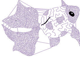
Figure 3: Result of a curve reconstruction

In carving step, we start from a Delaunay triangulation of the point set and progressively sculpt it as in the ec -shape method: starting from the exterior edges (edges not shared with any other triangle), edges are repeatedly removed until all the exterior edges satisfies the so-called diametric circle property (an edge ab is sculpted only if the circle with ab as a diametric chord is non empty). To avoid unnecessary blockages during sculpting, the algorithm removes an edge if its length exceeds a threshold (carving parameter).