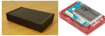
Figure 1 Edge Service Deployment Methods

service to independently manage itself, its communication and the analytical tasks it performs, based on characteristics that are specified within the semantic model. The system is broken down into two layers, core and edge. The core components operate over the entire urban water system and are generally hosted and operated centrally by water network operators. The edge components consist of a series of cognitive edge services, each of which is located at distributed locations within the water network and is responsible for managing aspects of the water network in that local area. Physically these edge services can be deployed on a variety of hardware from standard desktop computers, to custom made gateway boxes (left of Figure 1) to small integrated controllers (right of Figure 1).