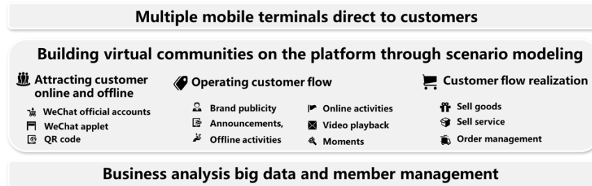
Fig.1. Modeling Method of DAJIA

The products of DAJIA build a customer service scenario platform for customer community flow. The platform is mainly divided into three parts, as shown in Figure 1, the introduction of customer flow, the operation of customer flow and the realization of customer flow. In introducing customer flow stage, the activity of introducing customer will be implemented on the community platform through scenario modeling, such as personalized interface, QR code, and promoters, etc., to increase new users and expand the community. Operation of customer flow is extracting existing scenarios (eg. short texts) from social networks (eg. WeChat, Weibo) to build a new scenario suitable for the transformation of traditional enterprises, in which customer traffic will be disseminated, converted, and tracked for retaining customers. Realizing customer flow is creating scenarios that generate consumer impulses to increase rebuys.