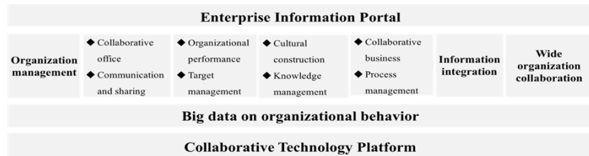
Fig.2. Enterprise Architecture of SEEYON

Because of the in-depth study of collaborative management and innovational development of collaborative management platform, SEEYON put forward enterprise architecture based on the collaborative technology platform, as shown in Figure 2.