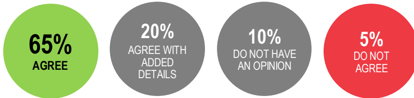
Fig. 4. Opinion about the Industry 4.0 definition (N=71)

The survey results observed in Figure 4 show that 65% of the respondents agreed with the definition mentioned above. Another 20% agree with the definition but would add further details, including AI decision-making and the cultural transformation required and 15% either do not have an opinion or disagree.