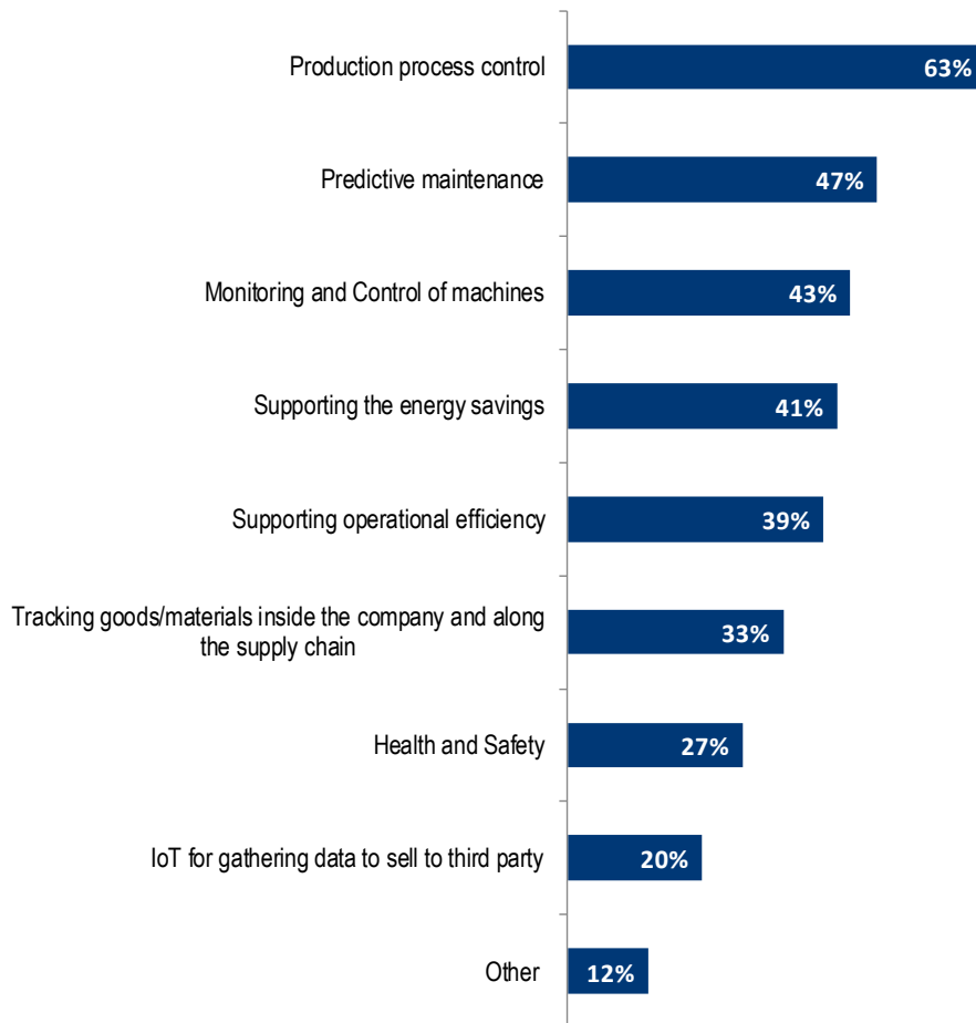
Fig. 6. Main industrial Applications for Internet of Things (IoT) (N=72)

b) Be clear on the industrial application: The top 3 applications of the IoT are: 63% in the production process to support the real-time process control, 47% to gather data and make informed decisions on predictive maintenance and 43% to monitor and control machines. Interestingly, the activities related to develop new services is still low. Figure 6 consolidates the results about the different applications.