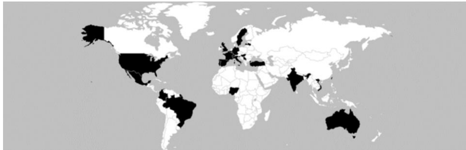
Fig. 2. Countries represented in the research (N=76)

In total 76 individuals located in 25 countries and working in a variety sectors provided a response. The distribution of responses per country, also shown in figure 2, was as follows: United Kingdom (16), Spain (12), Mexico (8), France (5), Switzerland (4), Italy (4), USA (4), Sweden (2), India (2), Slovenia (2), Taiwan (1), Belgium (1), Colombia (1), Hungary (1), Serbia (1), Turkey (1), Germany (1), Vietnam(1), Brazil (1), Latvia(1), The Netherlands (1), Nigeria (1), Australia (1), Portugal (1) and 3 were unknown. Figure 3 shows the different sectors.