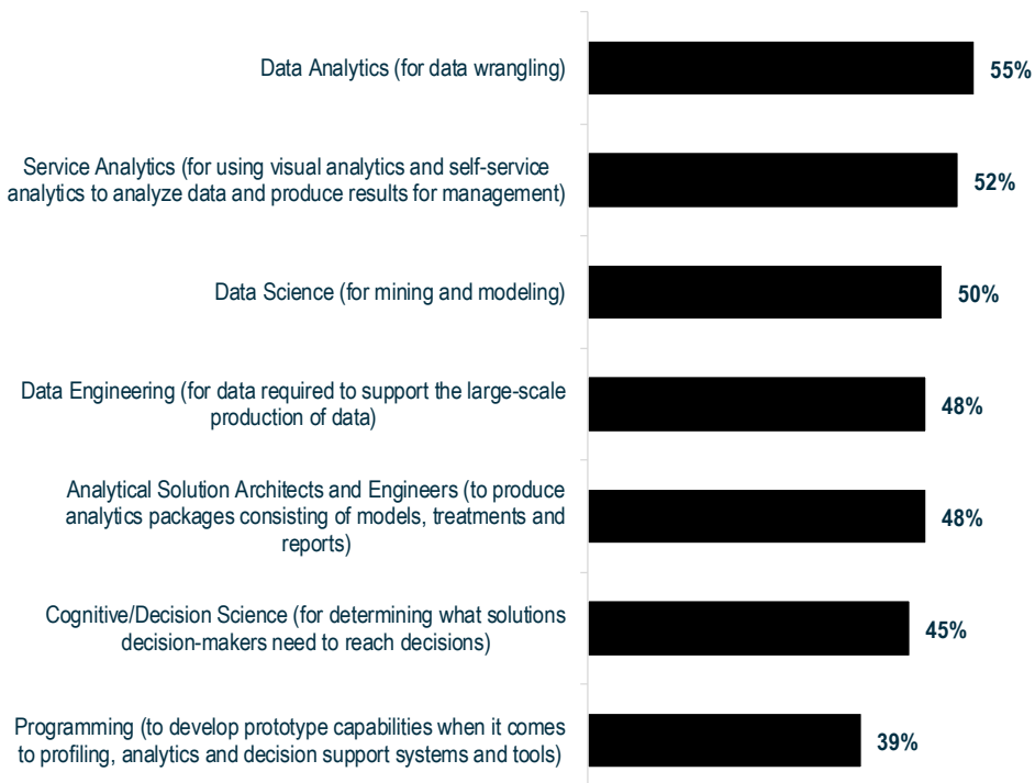
Fig. 7. Skills required to support big data analytics functions (N=73)

According to the analysis, the major enabler for big data are the employees’ mindset and skills. Figure 7 consolidates the most relevant skills identified in this research. The majority of the respondents built Data Analytics knowledge internally, either by educating existing employees or hiring talents. The position of internal data scientist is present in 57% of the organizations and 18% of the organizations still outsources the data analysis task due to the lack of talent.